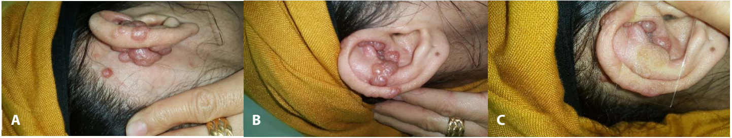
Figure 1. A solitary, pink, 1 cm diameter papule near the proximal hairline and similar heterogeneous papules behind the ear. B) Lateral and anterior ear helix lesions. Some are solitary or grouped, pink-violet papulonodules with heterogeneous color. C) Apple jelly sign on diascopic examination.

prior and they disappeared one month after delivery. The lesions had emerged again at the 8 th month of the second pregnancy and spontaneously regressed two months after delivery. Lastly, the nodules emerged again on the 7 th month of the third pregnancy and have lasted for the last 1.5 years. Her medical and family history was unremarkable.