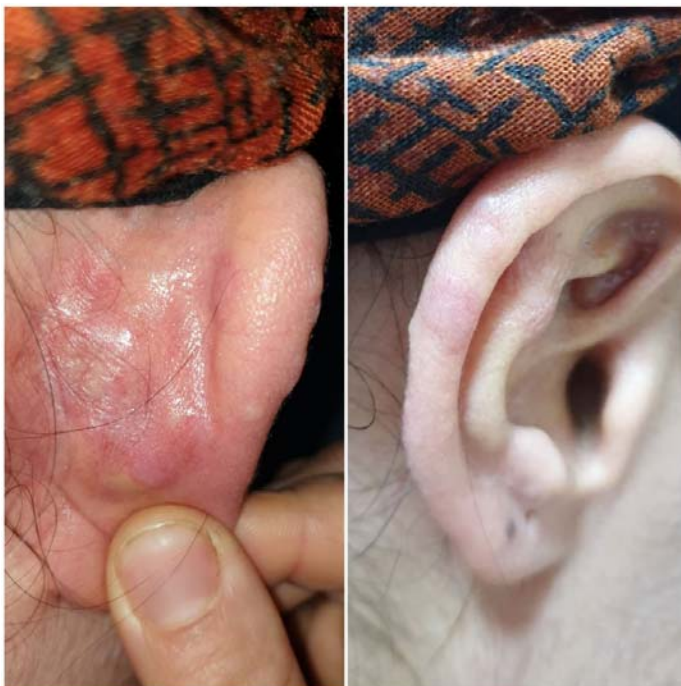
Figure 4. Approximately 90 % clearance of the lesions with Pro-Yellow laser treatment.

Although the etiology is not fully known, there are some cases in the literature indicating a positive relationship between ALHE and birth control pills or pregnancy. Some patients had used birth control pills, some of them had used birth control pills prior to onset of pregnancy, and some had only a pregnancy history [10-14]. Moy et al. showed increased levels of estrogen and progesterone receptors in the lesional skin compared to the non-lesional skin of two patients [10]. Damarla et al. have indicated that hyperestrogenic states and increased levels of estrogen and progesterone receptors in the lesions during pregnancy may have a role in the occurrence or aggravation of ALHE lesions. They have also indicated that estrogens may have an indirect role in ALHE etiopathogenesis without any overexpression of estrogen and progesterone receptors [9]. Our patient had three pregnancies and