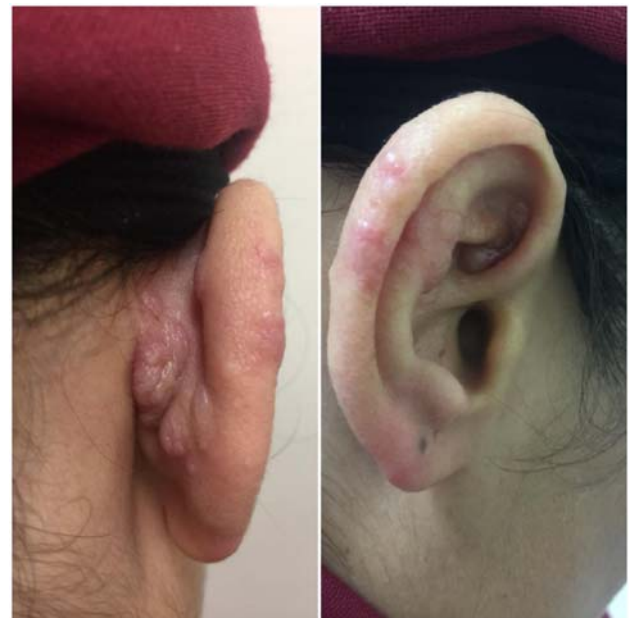
Figure 3. Seventy percent clearance of the lesions with systemic corticosteroid and intralesional corticosteroid injections.

injection and topical tacrolimus treatments were started. She has received three injections monthly. The response was not fully satisfactory. She exhibited a poor response to methylprednisolone, but when indomethacin was added she responded well within three months ( Figure 3 ). However, she stopped both treatments because of unacceptable side effects. Lastly, the patient received 577nm Pro-Yellow laser treatment (QuadroStarPRO YELLOW® Asclepion Laser Technologies, Germany) at 4-week intervals in three consecutive sessions at 20, 22 and 24J/cm 2 , and resulted in clearance almost completely ( Figure 4 ).