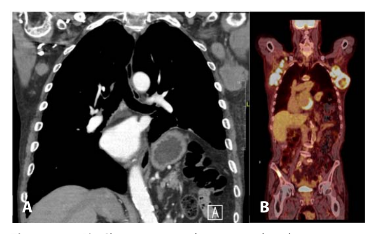
Figure 2. A) Chest computed tomography demonstrating bilateral enlarged axillary lymph nodes. B) Positron emission tomography scan shows bulky markedly hypermetabolic bilateral axillary lymphadenopathy. The largest left axillary lymph node demonstrates marked peripheral hypermetabolism with central photopenia reflecting necrosis.

A 92-year-old-man presented with a left axillary mass that appeared one month prior to presentation. In addition, he had a history of a skin lesions on his mid back that came up about a year ago ( Figure 1A ). The