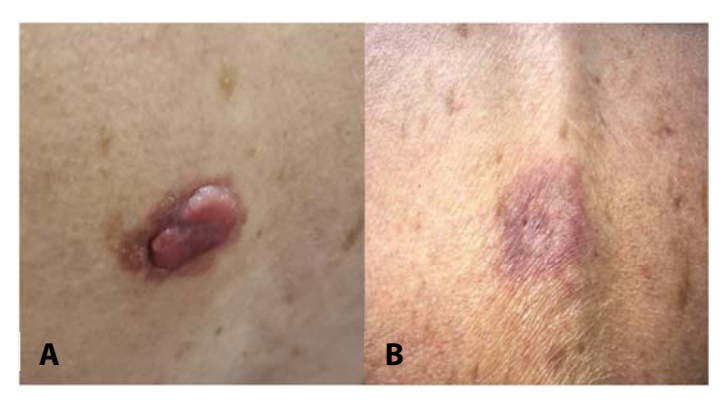
Figure 1. A) Rapidly growing tumor on the mid back, appears as exophytic erythematous to violaceous nodule. B) Spontaneous regression of the tumor.

The five-year survival for distant disease is particularly poor at 25% compared to 59% for regional and 75% for localized disease. The standard therapy for MCC is usually wide local excision combined with adjuvant radiotherapy. Sentinel lymph node mapping may improve regional control of the disease and relapse-free survival [5]. The value of adjuvant chemotherapy and immunotherapy remains to be determined and is currently only used for the palliative treatment of metastatic MCC [20].